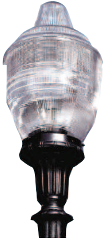
Model No.: LC-P605-80W