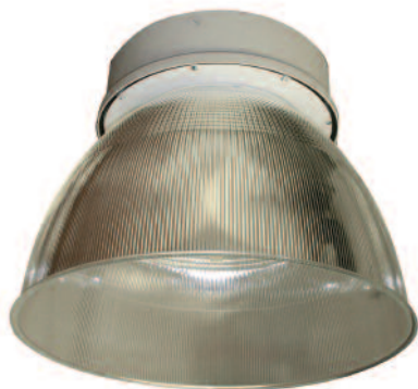
Item No.: LC-S111HB-200W

Available in wide range of color temperatures from 2700 – 6500°K. Also available in 120V, 208V, 220V, 240V and 277V.