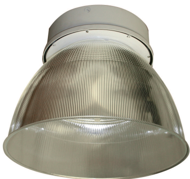
Item No.: LC-S111HB-400W