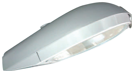
Item No.: LC-S106WR-40W

Available in wide range of color temperatures from 2700 – 6500°K. Also available in 120V, 208V, 220V, 240V and 277V.