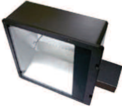
Model No.: LC-S108-SB-120W